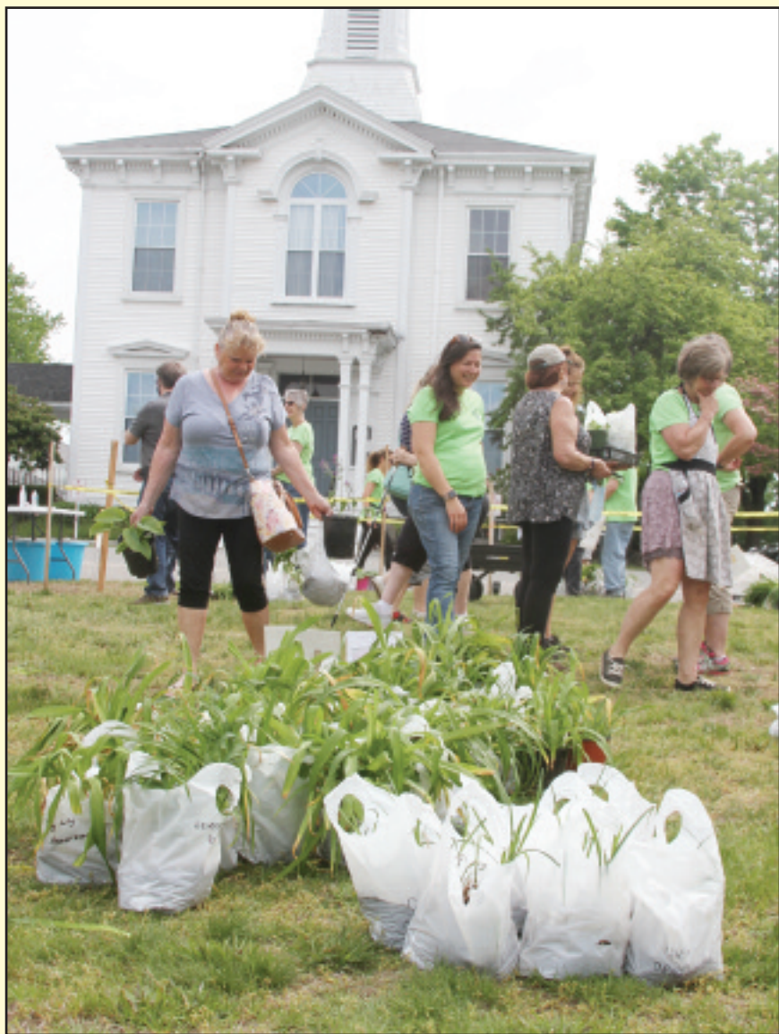
Sea of Green Members of the Hampstead Garden Club laid out hundreds of perennials in front of the Town Hall on Main Street Hampstead on Saturday morning for the plant sale that hasn't taken place for about three years. Members thinned out their gardens and sold bags of plants for $5 each. Buyers lined up early for the best choice.