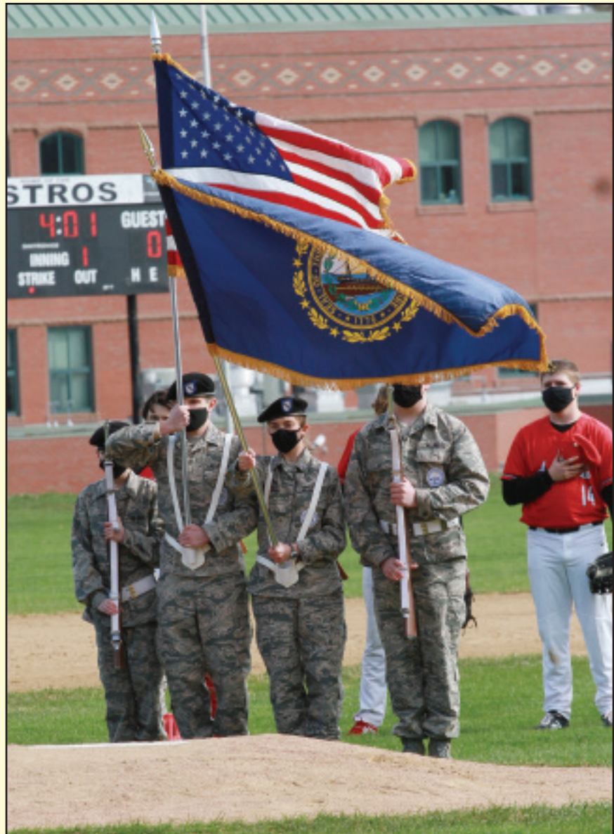
At Long Last The Pinkerton Academy JROTC Color Guard helped usher in the return of spring sports at the Astros Varsity Baseball game on Monday afternoon. The team has not played an official game since 2019 due the COVID-19 Pandemic restrictions, but they enjoyed a 3-1 home-opening win against Alvirne High School.