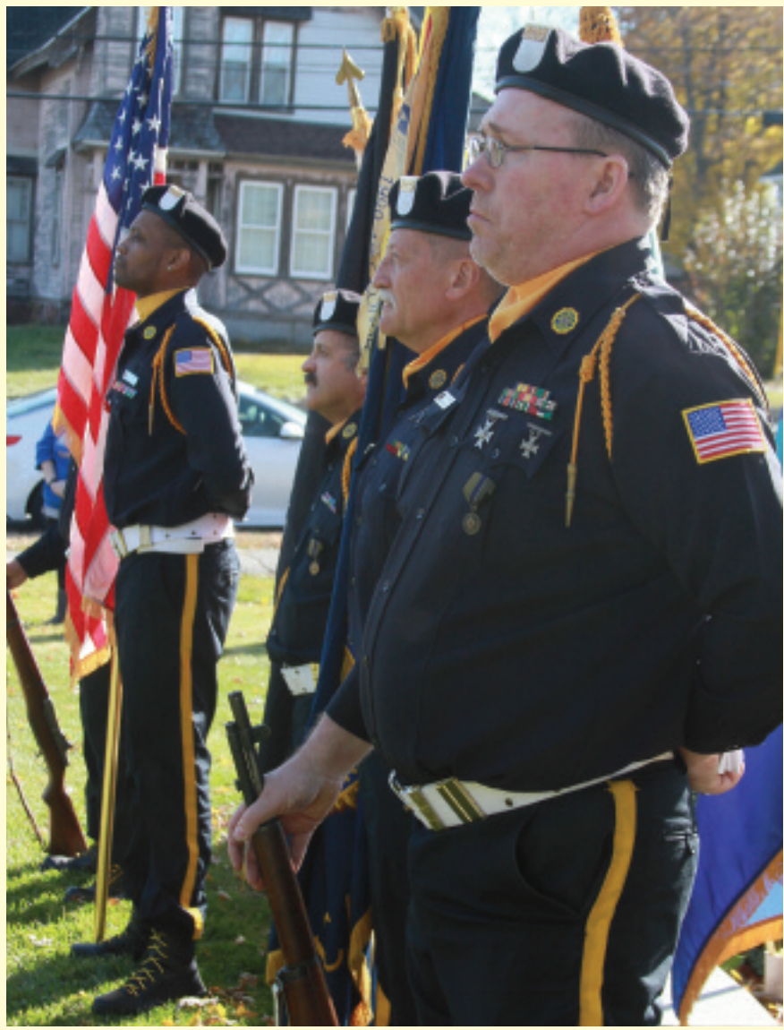
VETERANS HONORED The American Legion Post 9 and Veterans of Foreign Wars Honor Guard assembled at MacGregor Park in Derry on Thursday, Nov. 11, for the annual Veterans Day ceremony to honor those who served in the military. See more on page 5.