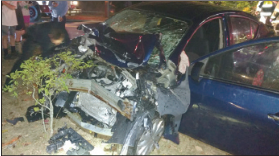
One of the vehicles involved in a head-on Crash in Chester.

The Chester Police Department was assisted by, and want to thank, the Auburn Police Department in this investigation.