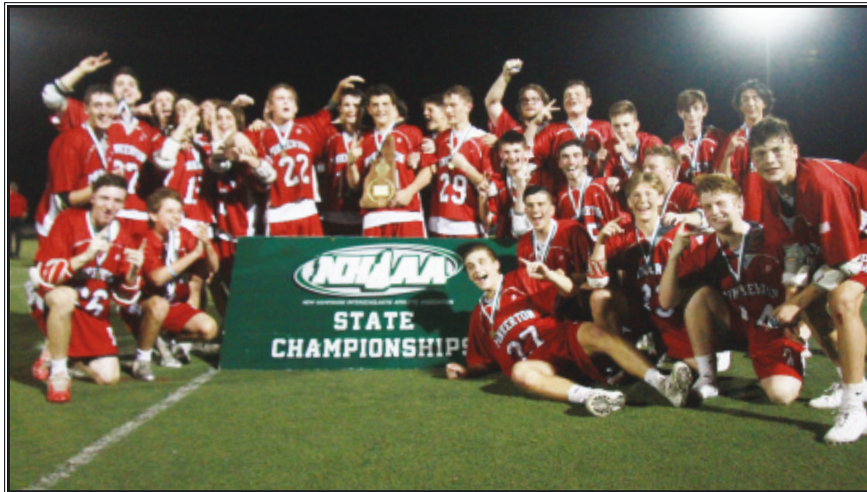
The Pinkerton Academy Boys Lacrosse team celebrates after receiving the DI Trophy Saturday night.