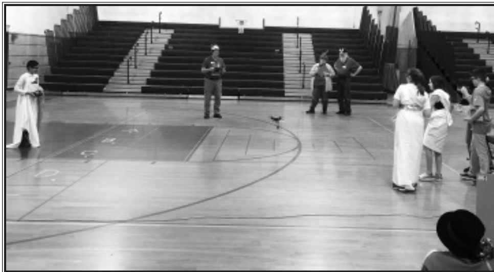
Team 7 Gods of DI from Ernest P Barka Elementary competed at Manchester Memorial High School in the Destination Imagination Elementary Level.

Each team faces a different challenge and competes in its age group: Elementary Level, Middle Level or Secondary Level. There is also a non-competitive Early Learning Challenge, where participants develop social and problem-solving skills.