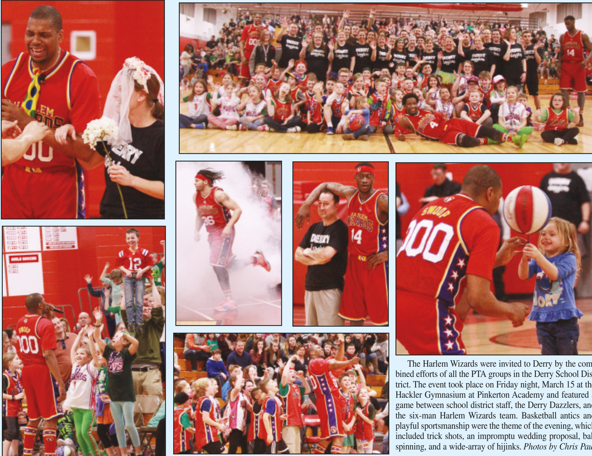
The Harlem Wizards were invited to Derry by the combined efforts of all the PTA groups in the Derry School District. The event took place on Friday night, March 15 at the Hackler Gymnasium at Pinkerton Academy and featured a game between school district staff, the Derry Dazzlers, and the six-man Harlem Wizards team. Basketball antics and playful sportsmanship were the theme of the evening, which included trick shots, an impromptu wedding proposal, ball spinning, and a wide-array of hijinks.