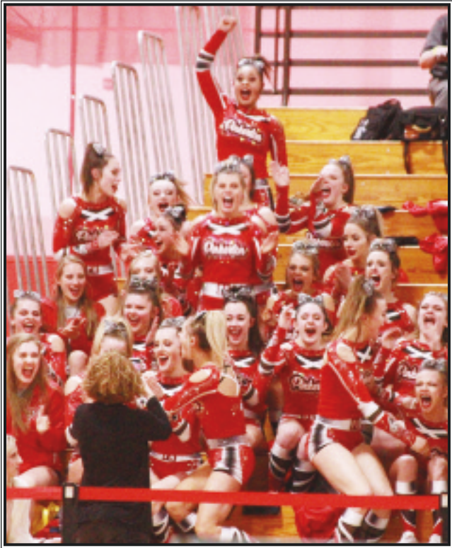
The 2019 Pinkerton Academy Varsity Cheerleading Squad celebrates as the announcement is made that they won the Division I New Hampshire Interscholastic Athletic Associations Spirit Competition. The girls scored 106.5 points out of a possible 110 in their winning routine.