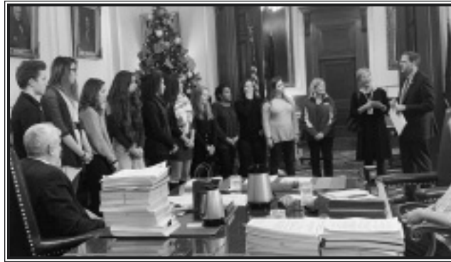
N. H. Executive Council and Governor Sununu Praise Pinkerton Academy Individuals for Their Leadership to Prevent Suicides.