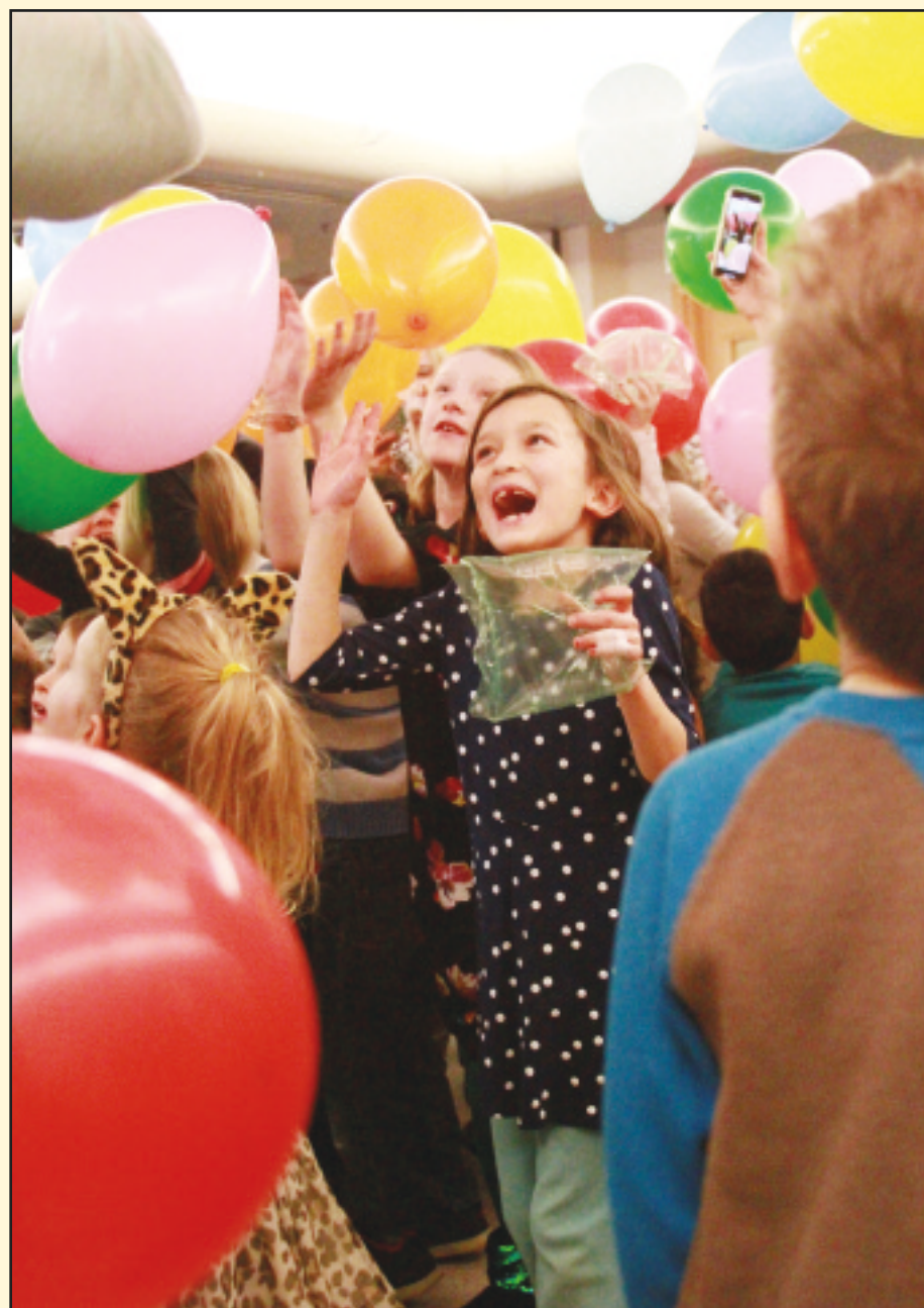
HAPPY NOON YEAR Participants at the Derry Public Library's Noon Year's Eve event celebrate the arrival of 2019 with a balloon drop on Monday, Dec. 31 at noontime. More photos page 5.