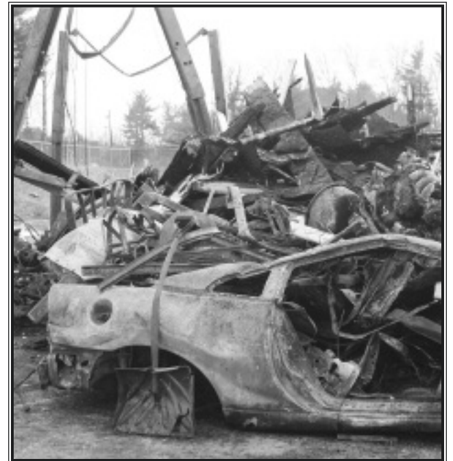
Clean-up is currently underway at the Watts Auto Salvage business after a fire on Friday, Dec. 28.

The portion of Rockingham Road where the business was located was closed for most of the day.