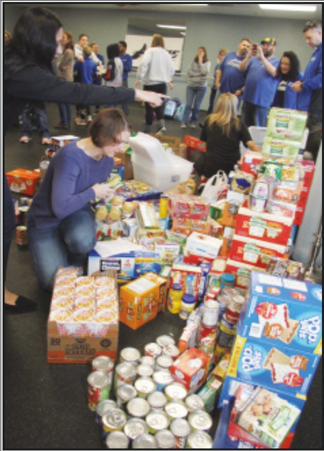
Hundreds of food items were collected and packed into back packs by the RAYS swim team on Saturday to help end weekend hunger.