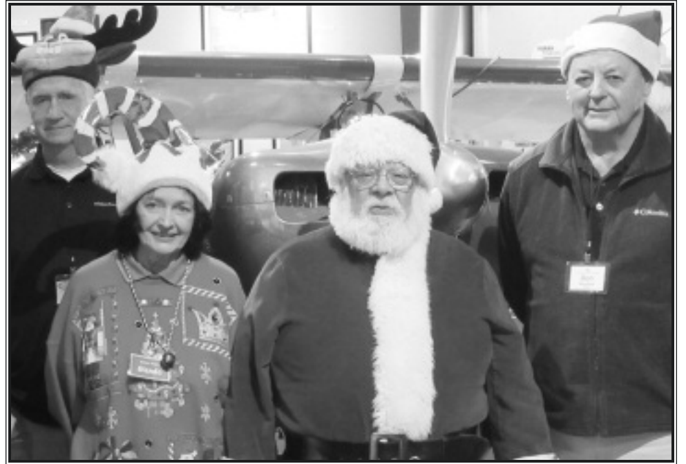
Santa Claus (seen here during a previous visit) will arrive by helicopter this year at the Aviation Museum

The museum is housed in the Manchester airport's original 1937 passenger terminal, a WPA project