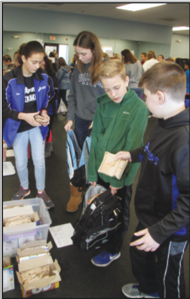
Asked about the values that the kids can receive from such community