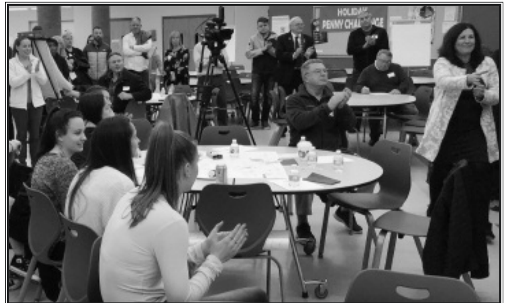
Groups gathered to participate in the Master Plan Update Workshop held at the Pinkerton Academy cafeteria last week.

Currently there is the Derry Age-Friendly Survey