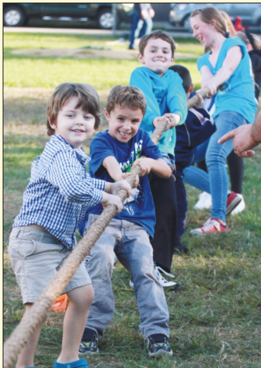
During the last event of the day, attendees at the Derry Village Rotary Oktoberfest event got to have a little fun with a game of tug-o-war. Other events included a keg toss, wife carrying races and a beer stein holding contest.