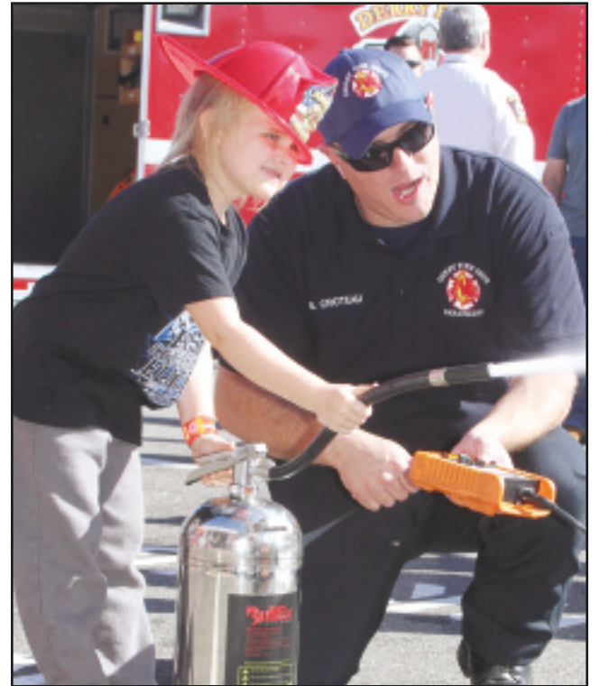
Youngsters will have the opportunity to learn how to use a fire extinguisher at the annual Fire Prevention Open House on Oct. 13.

There will also be pictures with Sparky the Fire Dog, Visit with Smokey Bear, get Home Fire Safety