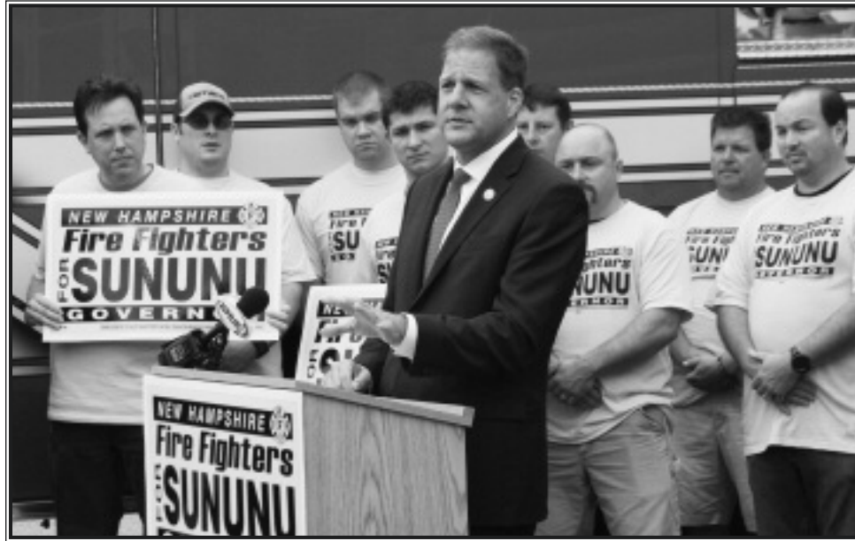
Governor Chris Sununu was surrounded by members of the Professional Fire Fighters of New Hampshire in Londonderry last week as they held a ceremony to endorse him during his campaign for re-election.

"The working men and women of New Hampshire sent Chris Sununu to Concord to fight for them, and