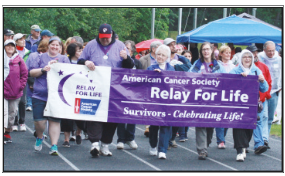
Cancer suvivors head out on the first lap around the Pinkerton Academy track to kick off the Relay for Life event each year.