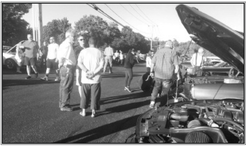
Hundreds of attendees enjoy the great weather and admire the beautiful vehicles at the first Cavalry Bible Church Cruise Night.

Regardless of the cars and raffles, the big focus of Church, noted that the event Night took things several food sales and raffles which