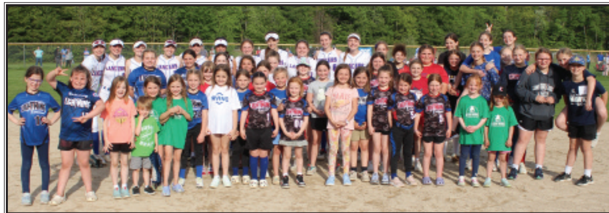
The Lancers softball team recently celebrated the third annual Little Lancer night with upcoming stars of the varsity team.