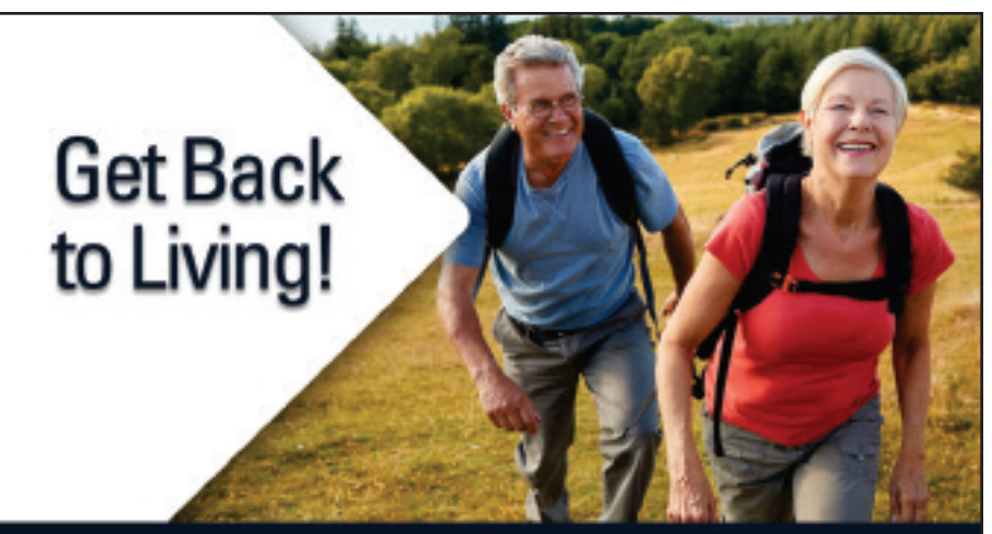
Discover Options for Managing Your Chronic Pain

Join Pain Solutions at this FREE Patient Education Event!