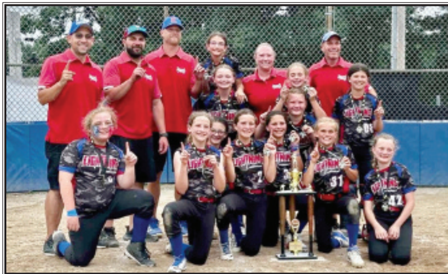
The Londonderry Lightning 10U softball team went 7-0 to win the New Hampshire Babe Ruth Softball 10U State Champions.

The Lightning has two other tournaments remaining this summer that are unrelated to winning state championship and hope to excel at those competitions also.