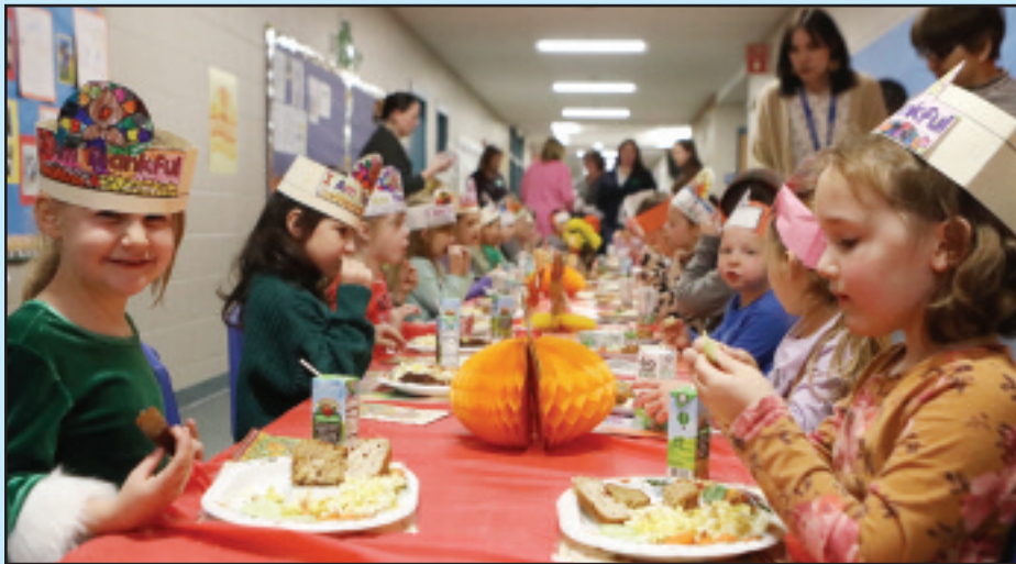
Moose Hill School students gathered at the long tables set up for the annual Thanksgiving celebration last week, just before the holiday break. Snacks were had during both sessions.