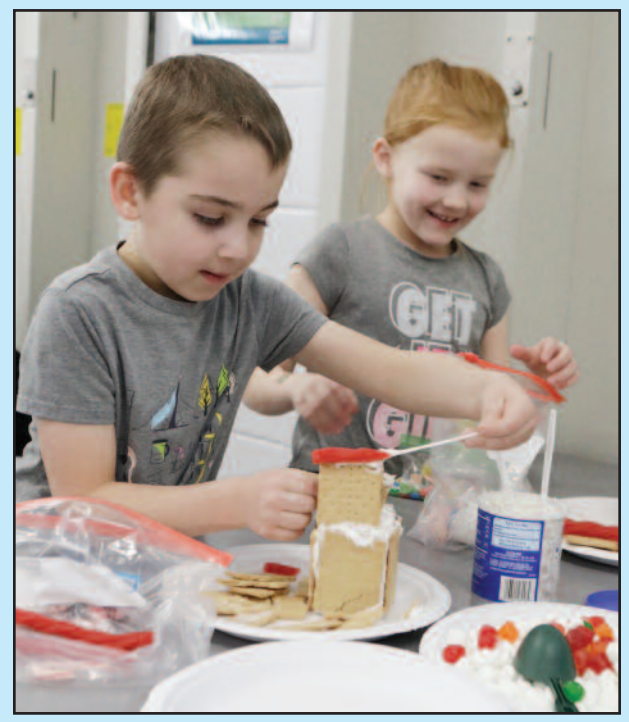
Second grade students at North Elementary School took part in the annual Gingerbread House building event on Friday afternoon, Dec. 13. Parents sent in thousands of sweet materials for the students to build with.