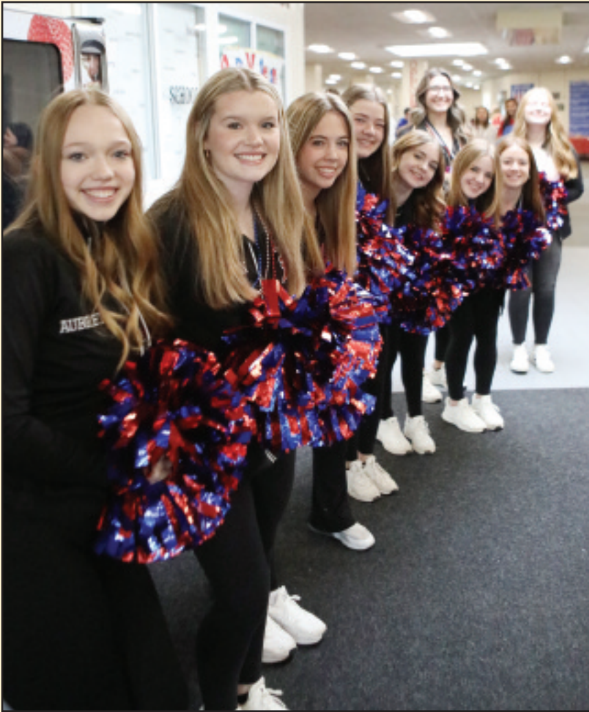
Members of the Londonderry High School Dance Team welcomed veterans at the the entrance of LHS with cheers at the annual Veterans Breakfast on Friday morning.