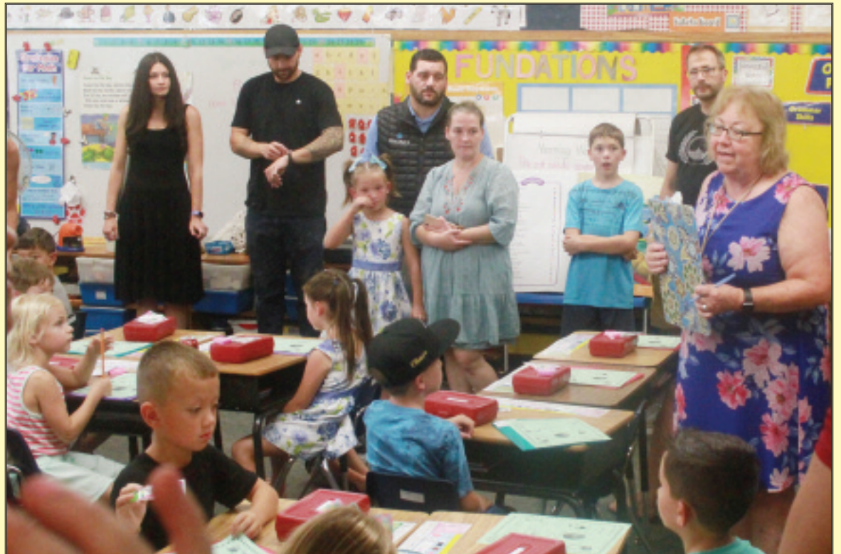
North Elementary School first grade students had a brief introduction to their classrooms on Monday afternoon during the school's Orientation Day. The youngster got to meet their teachers and classmates as they prepared for their first day of school on Tuesday.