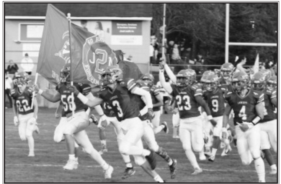
The Londonderry Lancers are off to another bid for a Division I title as they prepare for their first game in the State Championship on Saturday, Nov. 12 at home.

Hollis-Brookline beat LHS 3-1 in the final week of the regular season, handing them just their second loss.