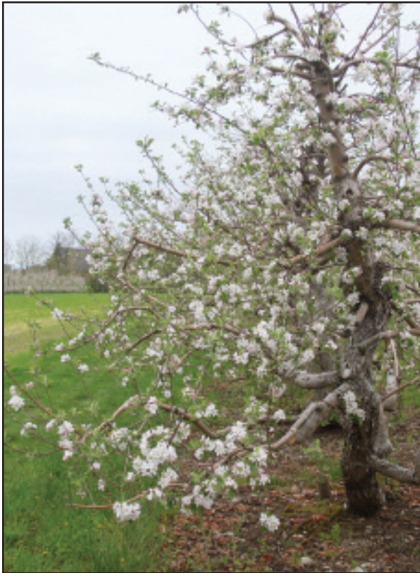
Blossoms are popping out on many of the apple trees on the Moose Hill Orchard land being purchased by the town.