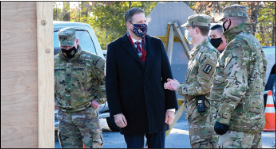
Governor Chris Sununu toured the state's fixed vaccination site in Londonderry as the first vaccinations were administered to individuals within Phase 1B.