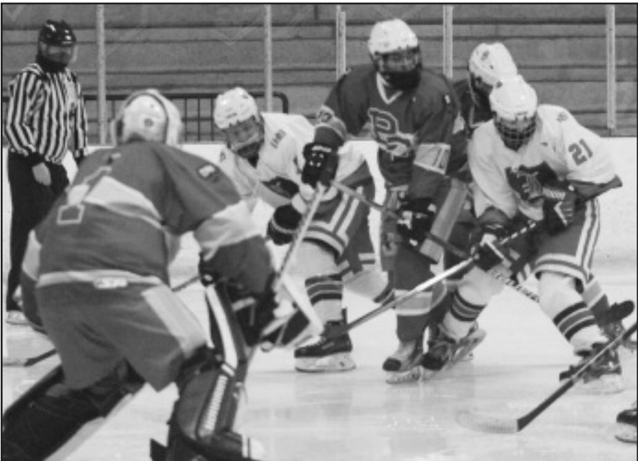
The Lancer Hockey Team had a hard time penetrating the Bishop Guetin defense in the first two games of the season. The team hopes to rebound against Salem this week.