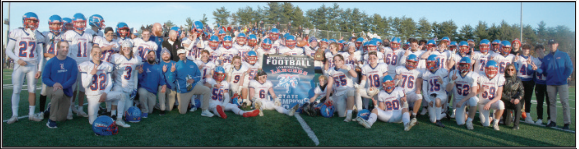
The Londonderry High School Football team capped off an exciting season with a state title after beating Winnacunnet 24-14.