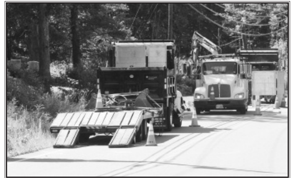
Pennichuck crews worked throughout the day on Labor Day to fix a broken water main on Pillsbury Road.

According to Pennichuck, customers were notified of the problem through Door-to-Door contact, Ver-