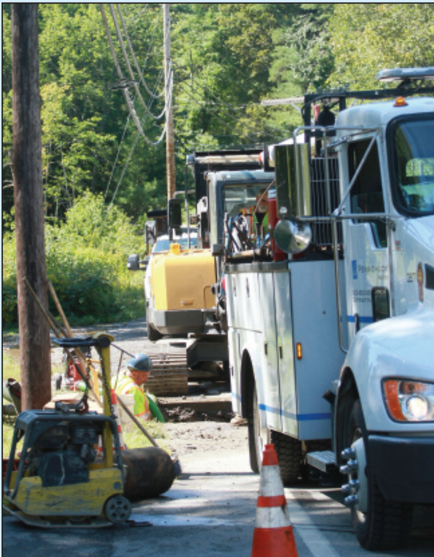
Pennichuck work crews worked throughout the day on Labor Day to fix a broken water main on Pillsbury Road.