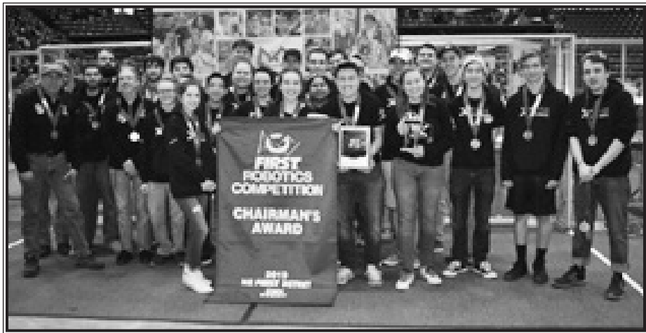
"District Qualifier at the UNH, in 2019. The Robotics Team won the Chairman's award, the highest award a team win at a district event."