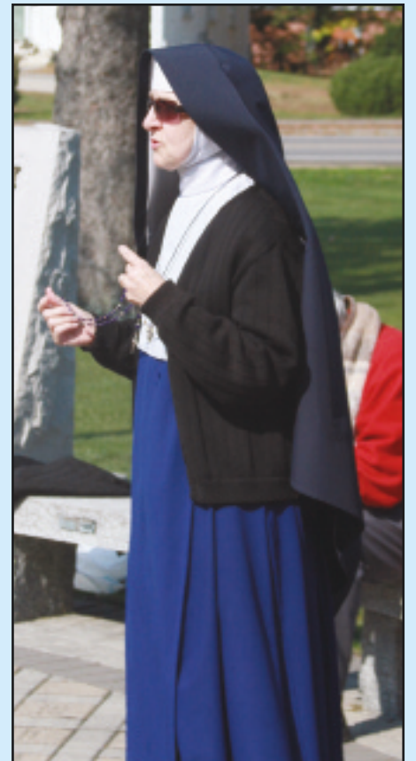
Members of Our Lady of Mount Carmel Church in Salem held a Rosary Rally at the Town Common on Saturday, Oct. 10, for community members to join them in praying for an end to the problems associated with the current pandemic. The service was part of the American TFP - America Needs Fatima effort and the Public Square Rosary campaign. The idea of holding a yearly rosary in a public place across the United States is viewed as a natural response to the Fatima call for conversion, penance and prayer.