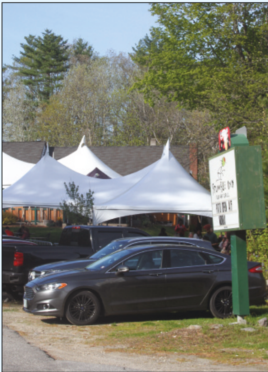
Outdoor dining has started for many of the restaurants in town. The Stubble Inn is one of many that began this week.