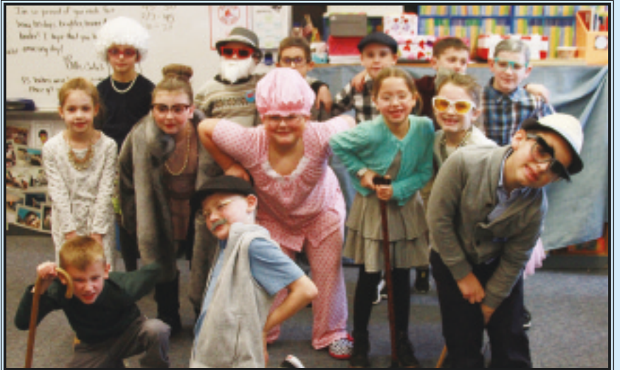
First and second grade students at South Elementary School celebrated hitting the 100th day of school last week, on Wednesday, Feb. 12. The classes had lots of activities for students based on the 100 theme. Counting, building, adding and reading were a few of the things children did. A good many of the students dressed up as 100-year-olds