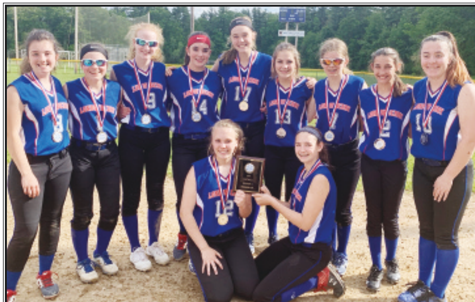
Londonderry Middle School Softball L Team made it to the Division I Tri-County Finals this year, where they came up just short of a title in a 8-4 loss.