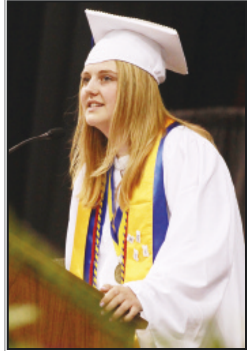
Pictured are some of the many highlights at this year's Londonderry High School graduation ceremony held at the Southern New Hampshire University Arena on Friday night, June 14.