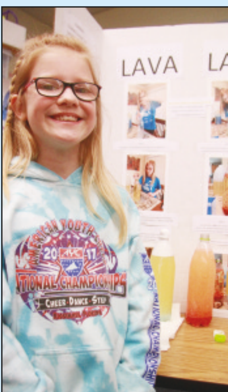
Fouth grade students at North Elementary School hosted the schools annual Science Fair. Family members and students in other grades were shown some of the many experiments the students had performed and the scientists were on hand to explain their findings.