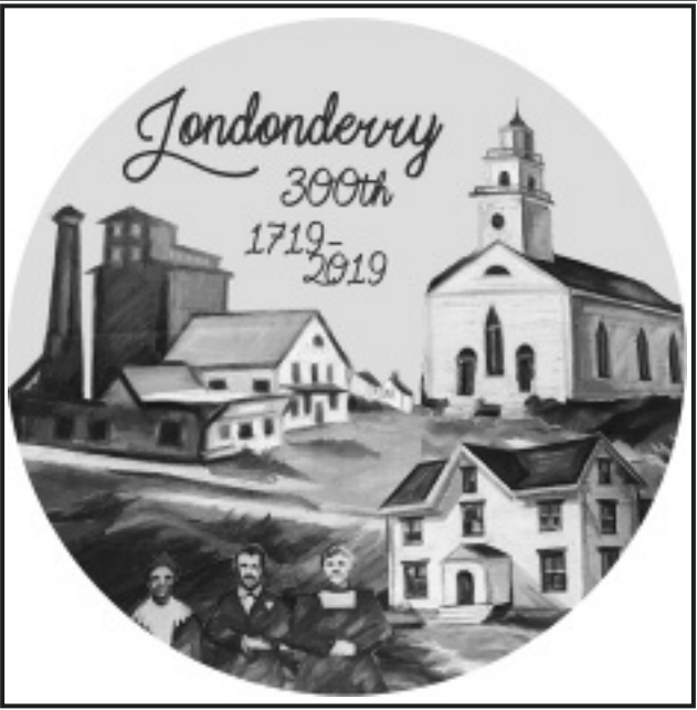
The latest rendition of the commemorative coin being made to mark Nutfields 300th anniversary.