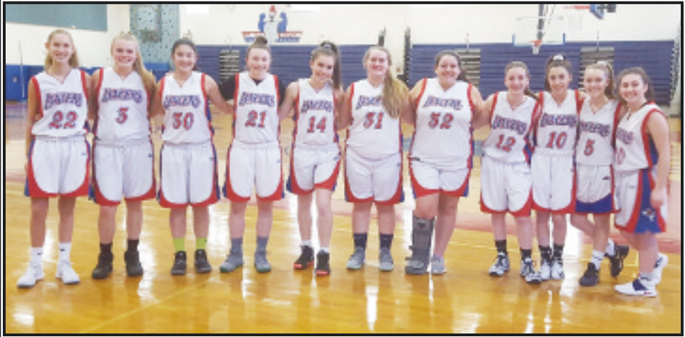
Lancer JV Girls Basketball team finished the season with a 12-6 record and made it all the way to the JV Semifinals.