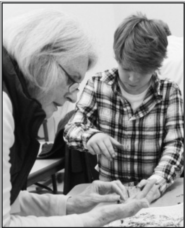
Children at the Boys and Girls Club in Derry built paper planters and learned how to plant marigold seeds as the Derry Garden Club gets another season going at the club.