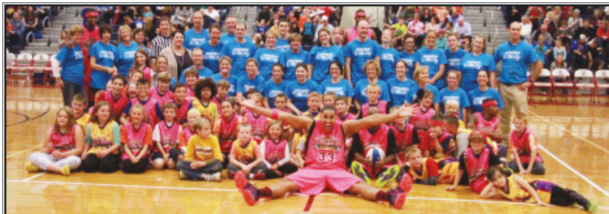
The Harlem Wizards and the combined elementary school teams gathered for a group photo in 2015.