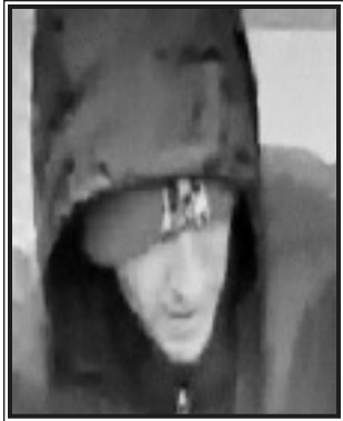
Surveillance image of the person who held up the TD Bank last Tuesday.