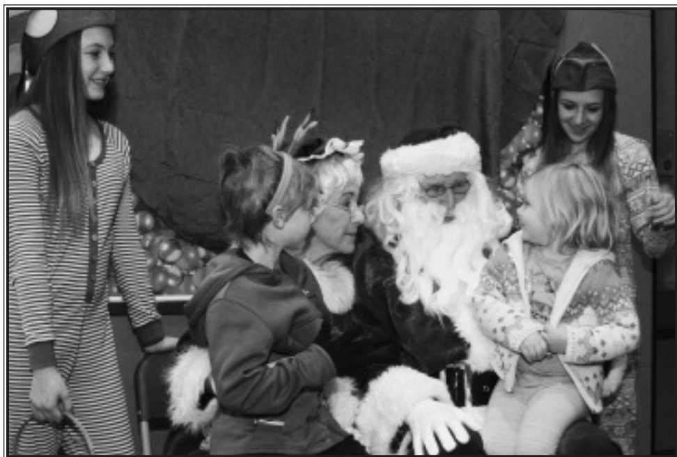
Families were greeted by Mr. and Mrs. Claus as they entered the Londonderry Police Station during their annual holiday movie night.