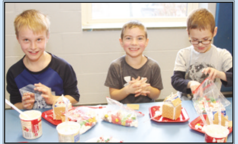
Second Grade students at North Elementary School had more than enough candy to coat the outsides of their Gingerbread Houses last week as parents, staff and student filled up the tables in the cafeteria for the school's annual event.