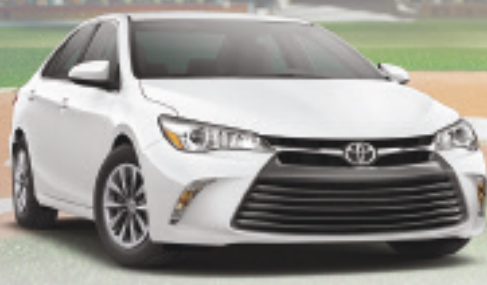
NEW 2017 Toyota CAMRY LE