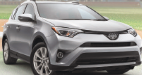
NEW 2017 Toyota RAV4 LE AWD

0% FINANCING AVAILABLE FOR UP TO 72 MOS. APR 283 IN STOCK!