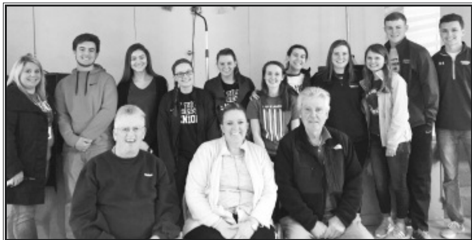
Members of the Lion's Club and Pay It Forward Club preparing for the Spring Fling Dance

The Lions Club is based out of the Lion's Hall, also seeking the same goals as the Pay It Forward club. Lion's Club International was founded back in 1917 in Oak Brook, Illinois by