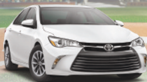
NEW 2017 Toyota CAMRY LE