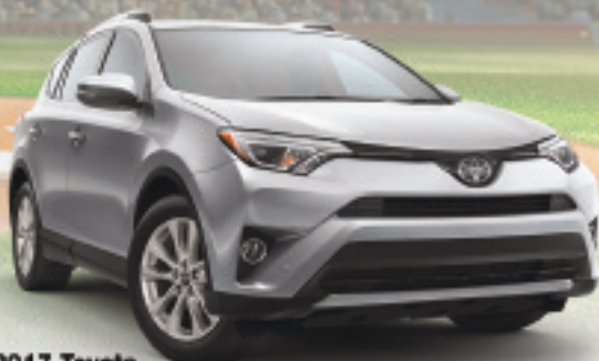
NEW 2017 Toyota RAV4 LE AWD

0% FINANCING AVAILABLE FOR UP TO 72 MOS. APR 283 IN STOCK!