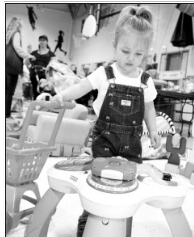
The annual Londonderry Womens Club Toy swap is a favorite for the younger shoppers in town.

More information about the toy swap and the LWC in general can be found at http://londonderrywomensclub.com/ .