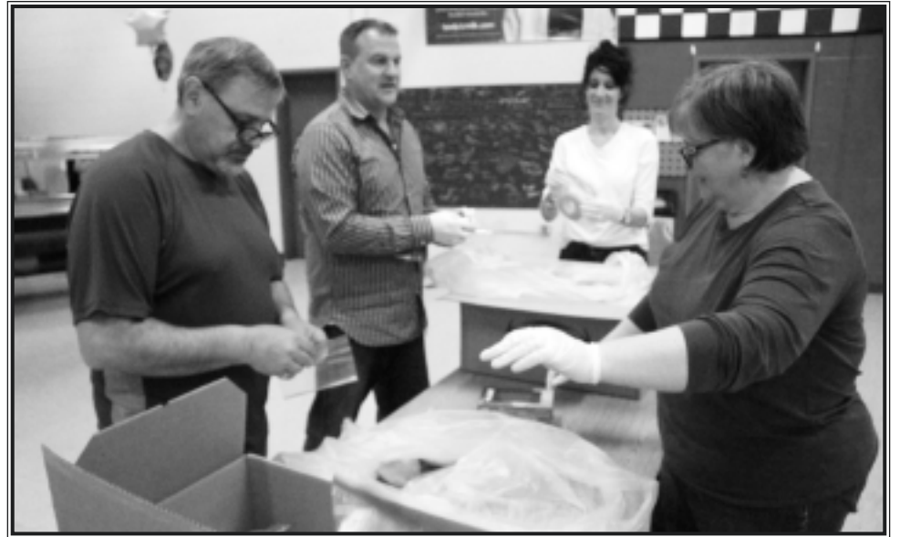
Members of Londonderry Church Alliance gathered on Monday evening at the Middle School to prepare over 400 food bags for eighth grade students. The group has been doing this for over a decade.