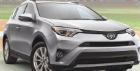
NEW 2017 Toyota RAV4 LE AWD

0% FINANCING AVAILABLE FOR UP TO 72 MOS. APR 283 IN STOCK!