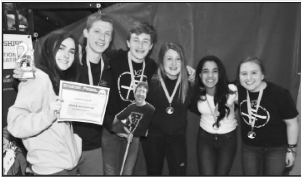
The "Technical Challenge Team" advanced to the Destination Imagination Global Finals in Tennessee this year.