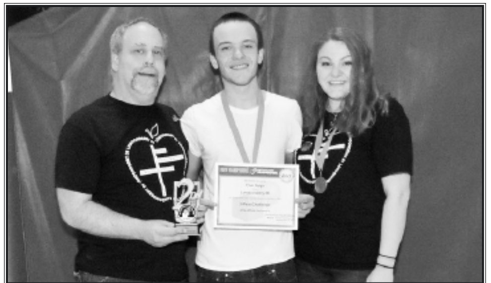
"Five Guys," an improvisational team, advanced to the Destination Imagination Global Finals this year.